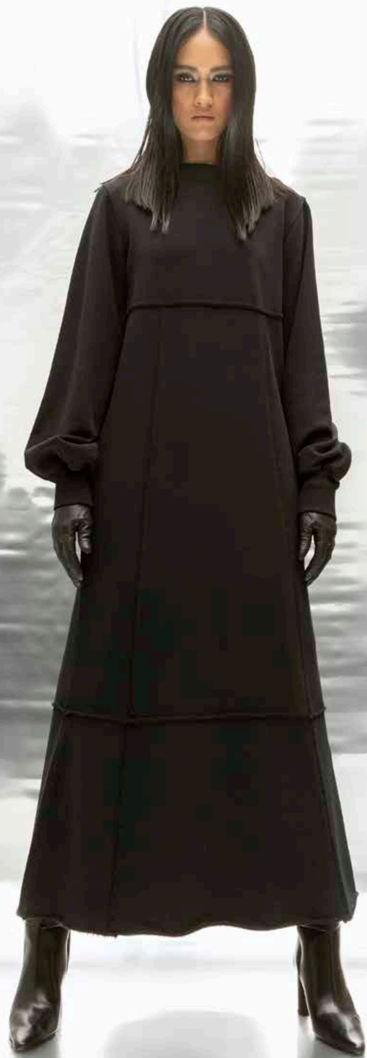
MOD. A09 ART. J150