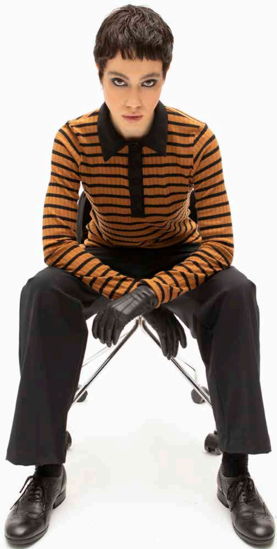
MOD. M01 ART. RM100 MOD. P10 ART. PK100