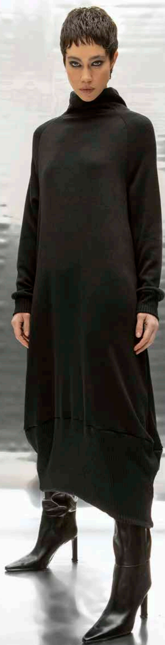
MOD. A10 ART. ML100