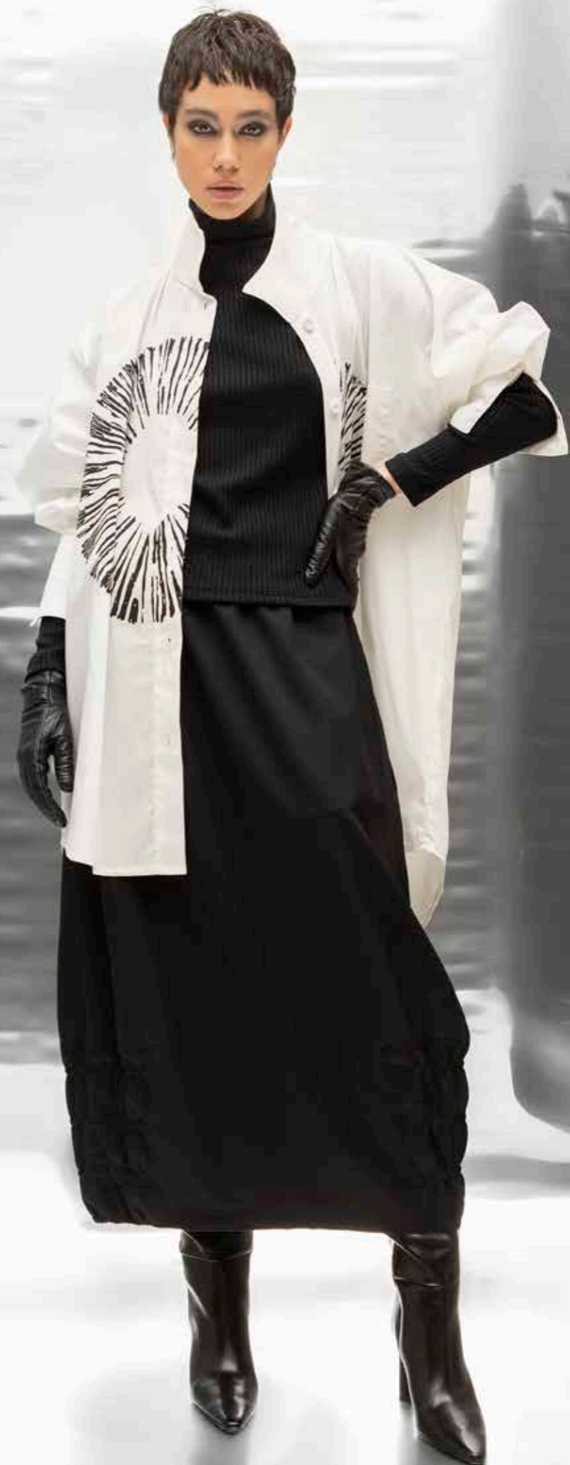
MOD. M76 ART. CR100 MOD. C02 ART. TCS MOD. G07 ART. PK100