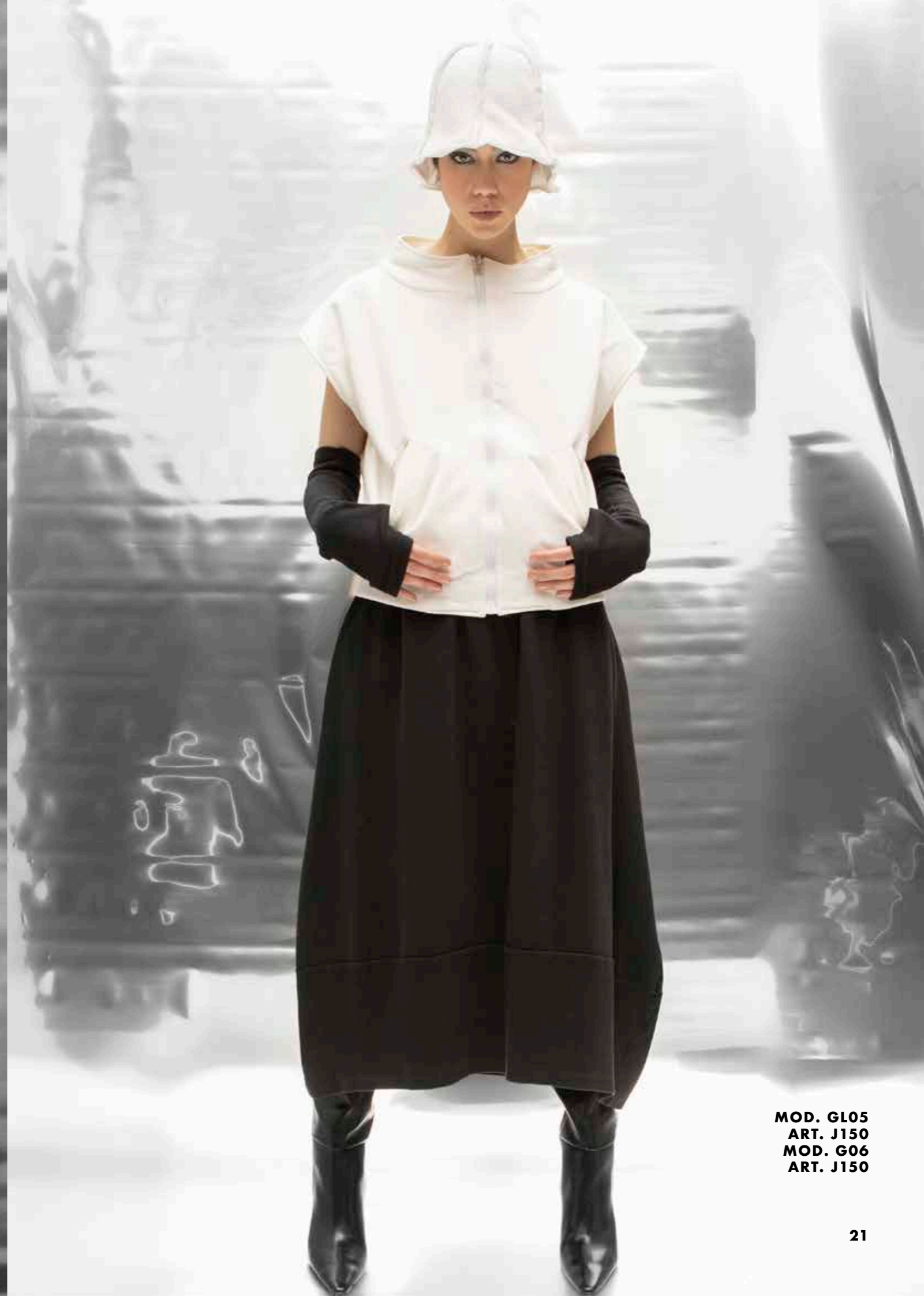
MOD. GL05 ART. J150 MOD. G06 ART. J150