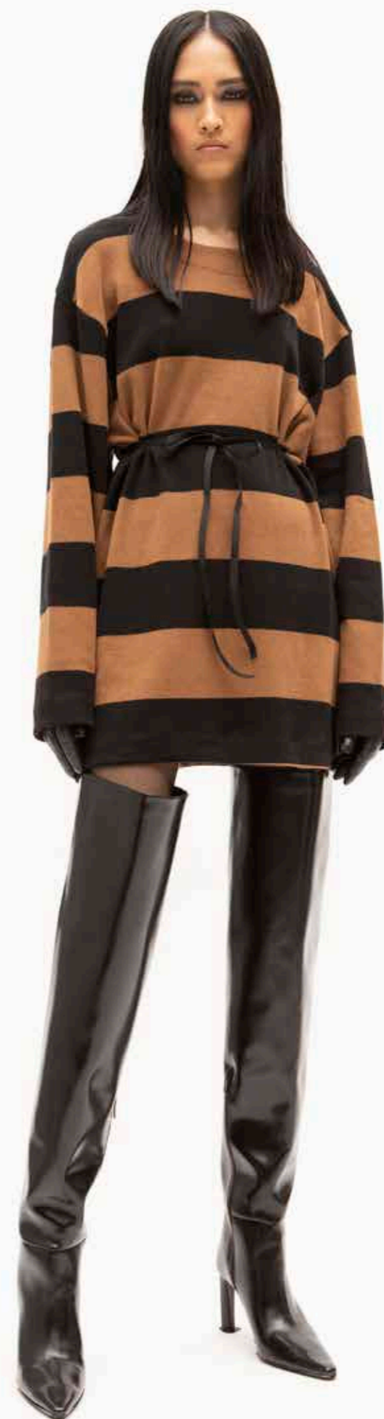
MOD. M03 ART. RP100