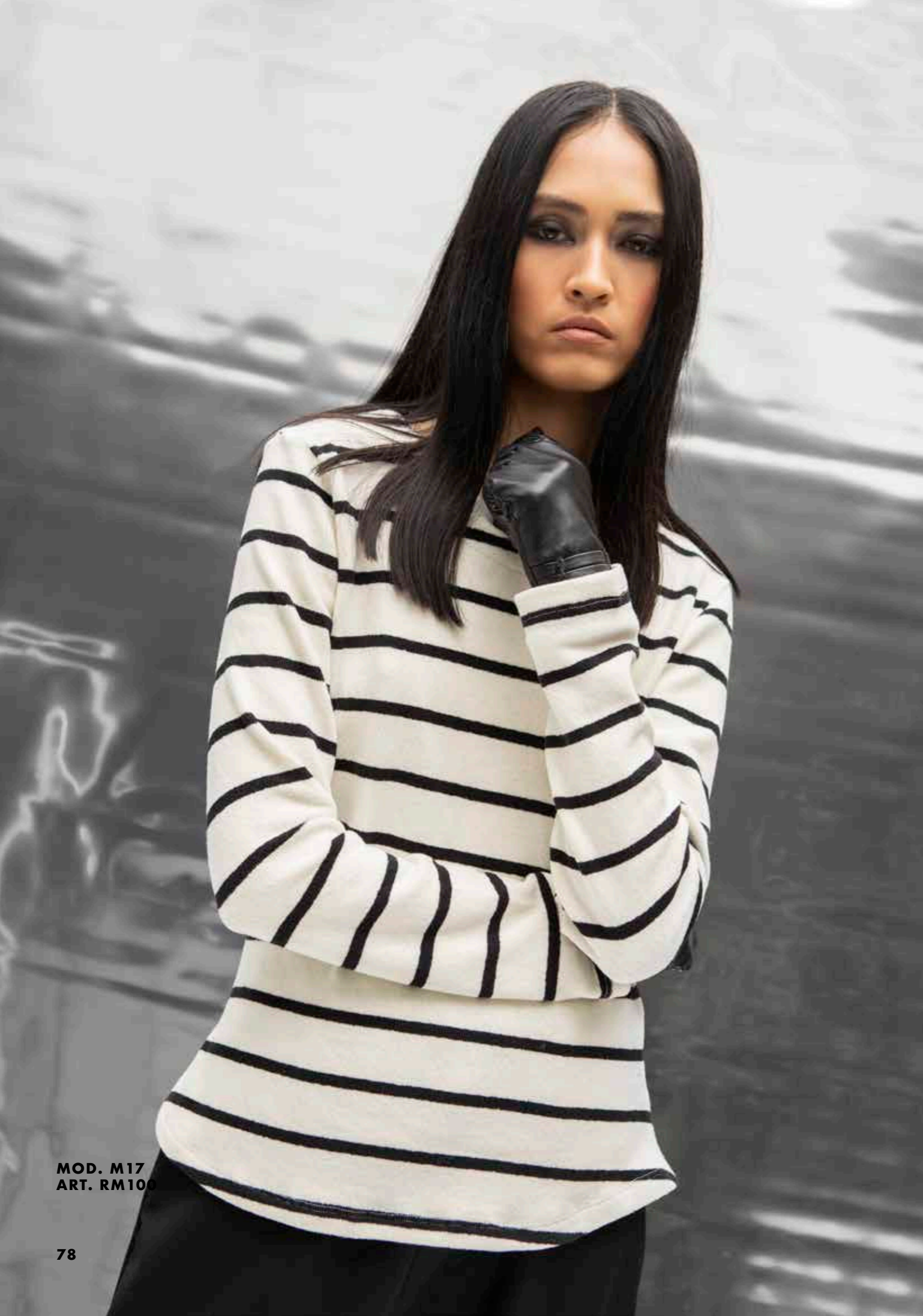
MOD. M17 ART. RM100