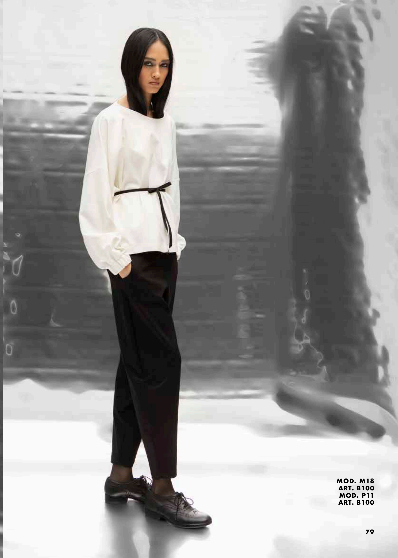
MOD. M18 ART. B100 MOD. P11 ART. B100