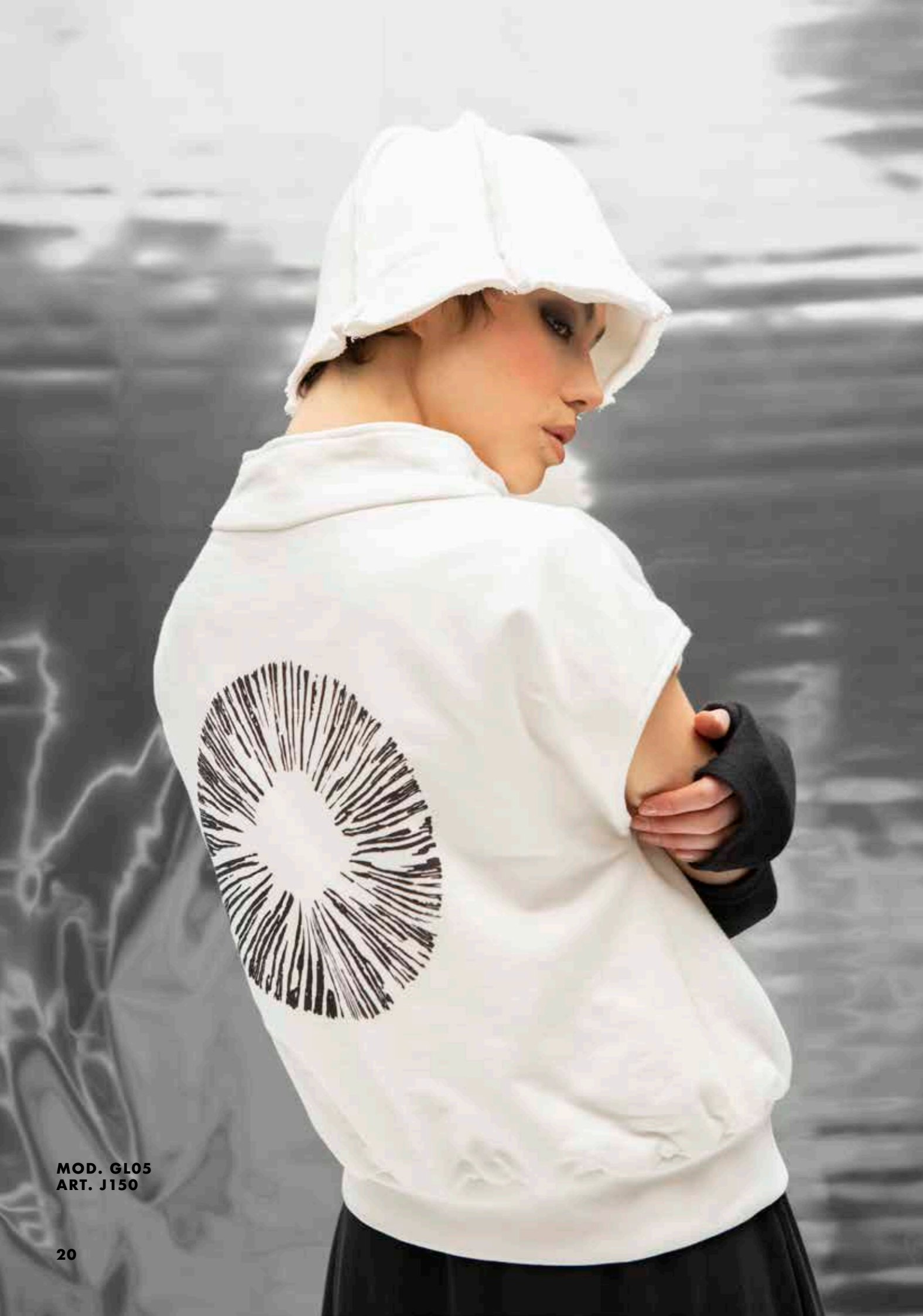
MOD. GL05 ART. J150