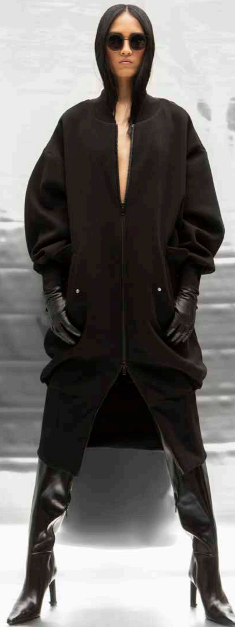
MOD. CA01 ART. J200